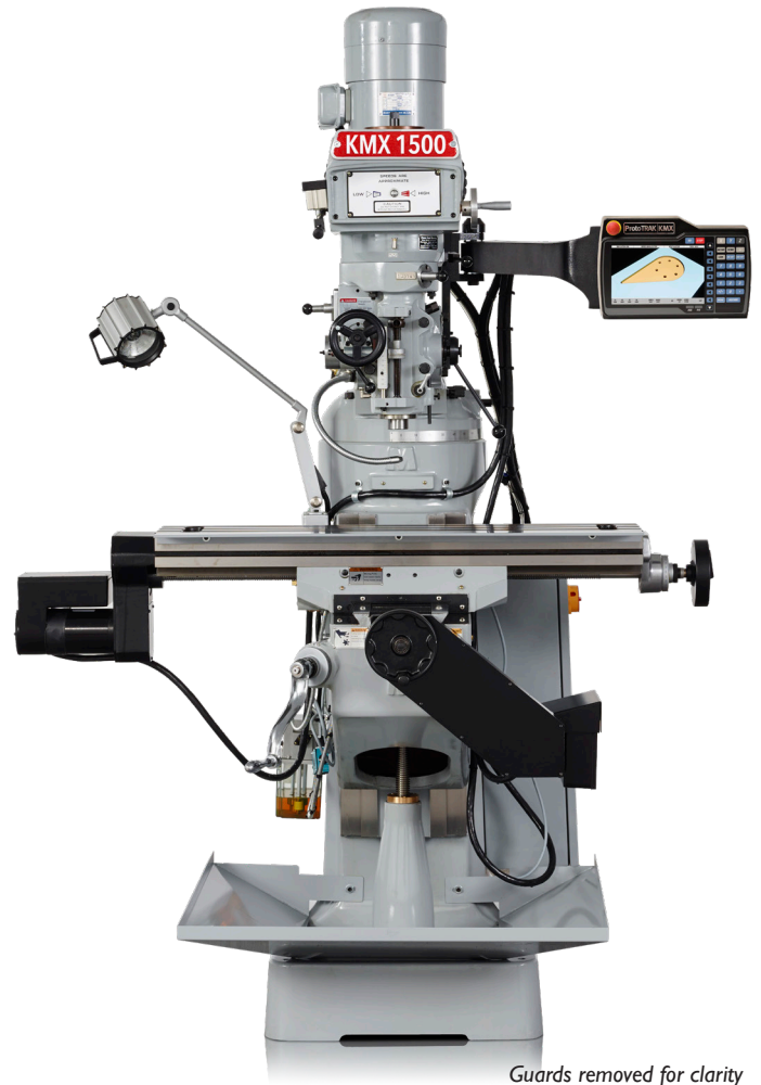
Guards removed for clarity

TRAKing®. Riser Blocks. Air Power Drawbar. 4th Axis DRO. Offline Software. Tooling, Vices etc. Parasolid and DXF Convertors. Millstar (Quill DRO).