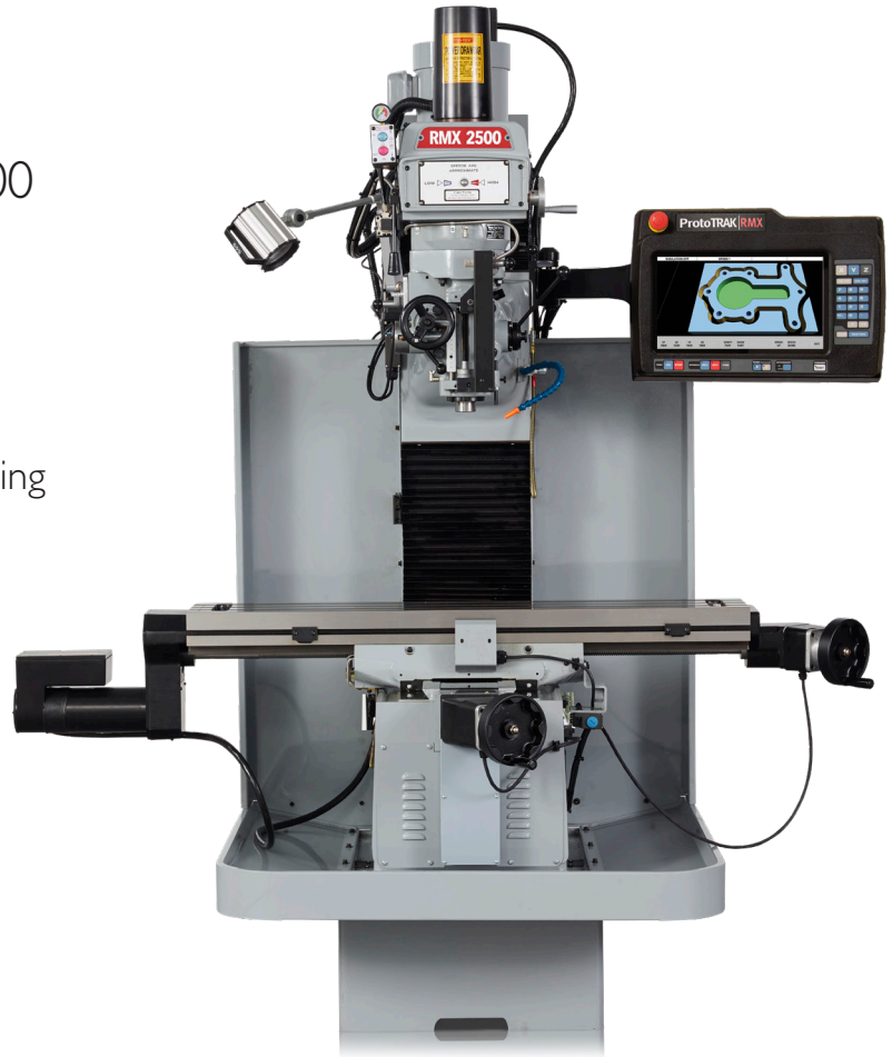
Guards removed for clarity

Advanced Features. Riser Blocks. Offline Software. Tooling, Vices etc. DXF Converter. Parasolid Converter. Programmable 4th Axis.