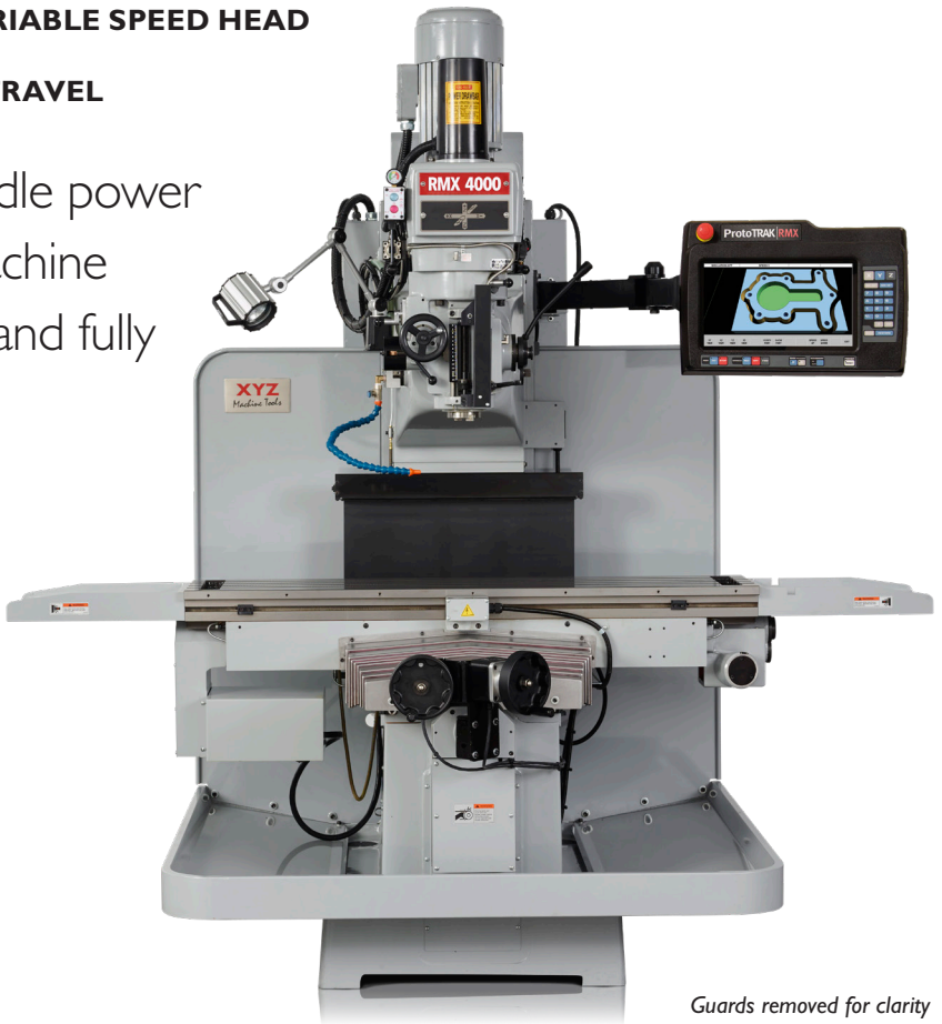
Guards removed for clarity